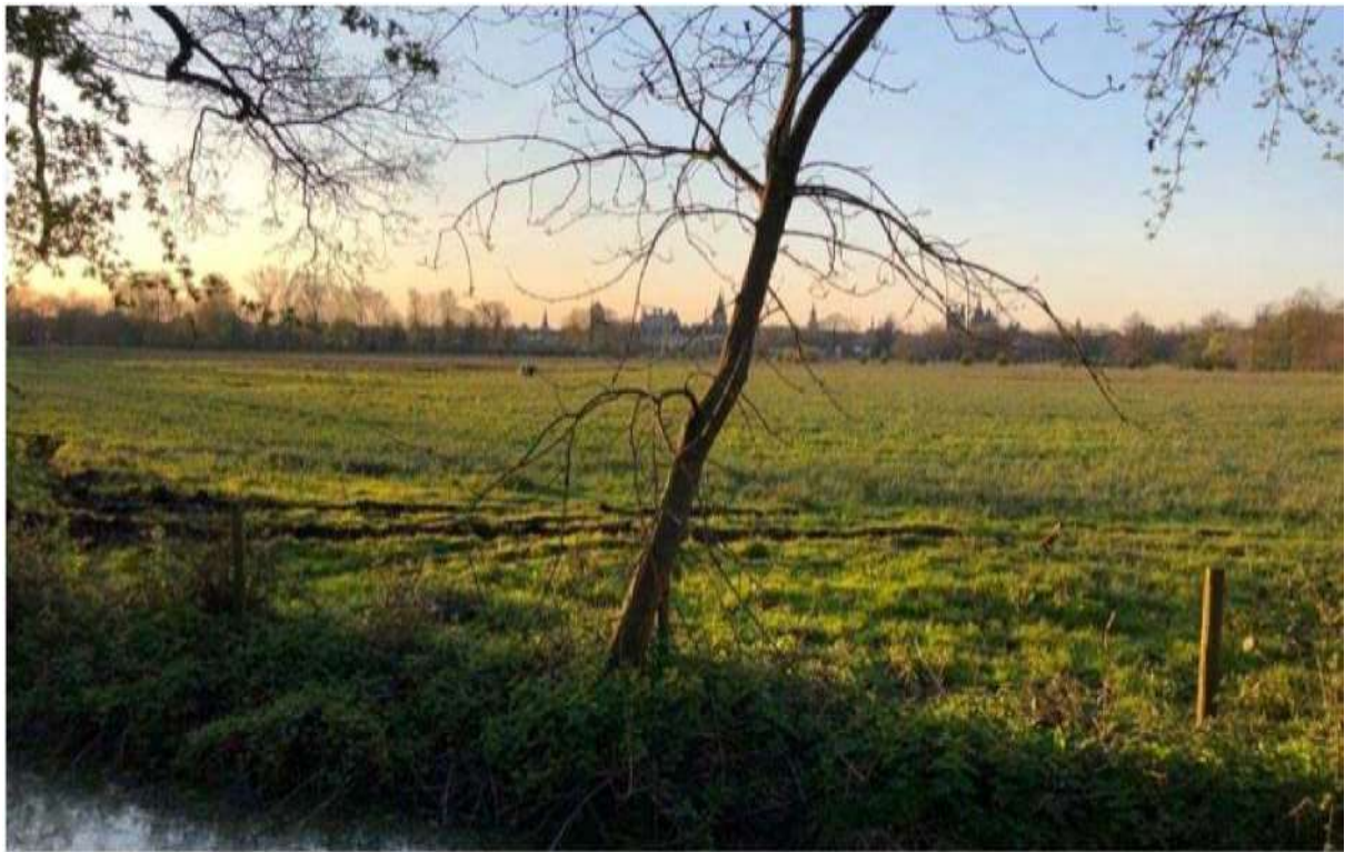
Christ Church Meadow by sunset