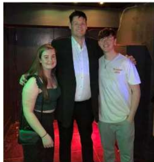
Meeting The Beast from The Chase in Atik (I'm not sure why he was there either...)

Tuesdays sees the weekly LGBTQ+ at the Plush Lounge off Cornmarket Street, named appropriately, Tuesgays. The Bullingdon Club (affectionately nicknamed 'Bully') also has Fluorescent Adolescent club nights on a Tuesday which, despite sometimes being a bit raucous, always have great music if you're an indie/britpop lover. Wednesday night offers Parkend at Atik whilst Thursday beckons for Bridge Thursdays, unsurprisingly at The Bridge, held generally to be one of the better nights of the week. The O2 on Cowley Road also offers monthly themed and special club nights, including a silent disco.