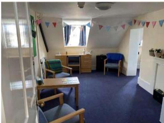
A room in Front Quad

You will only get to stay in your college room for the duration of the 8-week term, which means that you will have to move all your belongings in and out of the rooms at the beginning and end of each term. There is the possibility of applying for vacation residence (vac res) should this be something that you need; you will receive more information about this directly from college, so make sure you check your emails for any important deadlines!