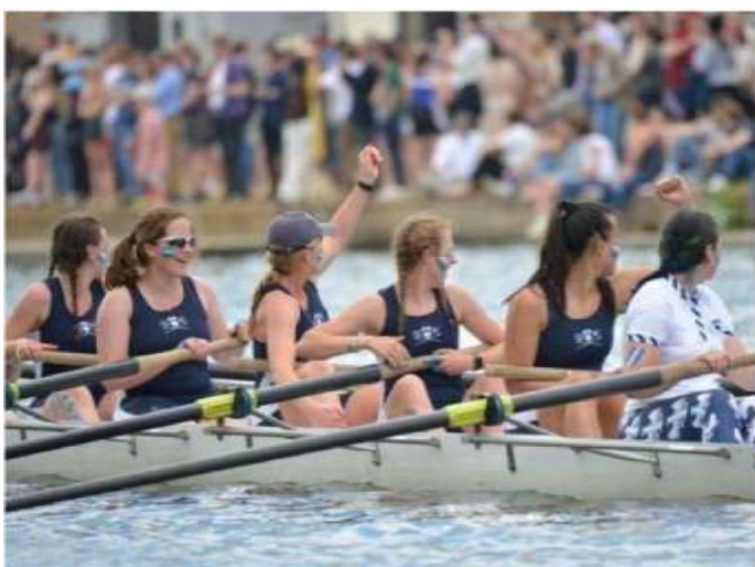
The W1 boat at 'Summer Eights'

For Oxford wide sport, visit http://www.sport.ox.ac.uk