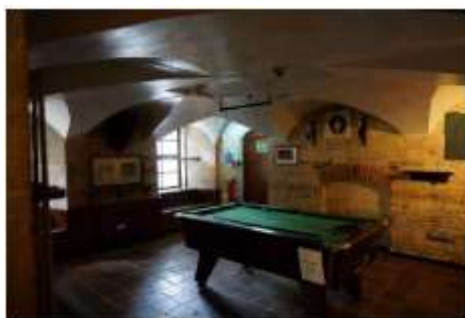
The Beer Cellar, not often seen by natural light

The Beer Cellar (or BC for short) is the college bar, located in the basement of FQ 2. It's usually open a few nights a week, serving very cheap drinks (which are paid for via Bod Card, and then added to your termly batells). BC also has its own pool table and darts board, as well as a games machine (featuring thrilling classics like Are you smarter than a 10 year old? ) and a jukebox. It has also hosted open mic nights with the EMS music society, and is the perfect socialising spot even if you don't drink.