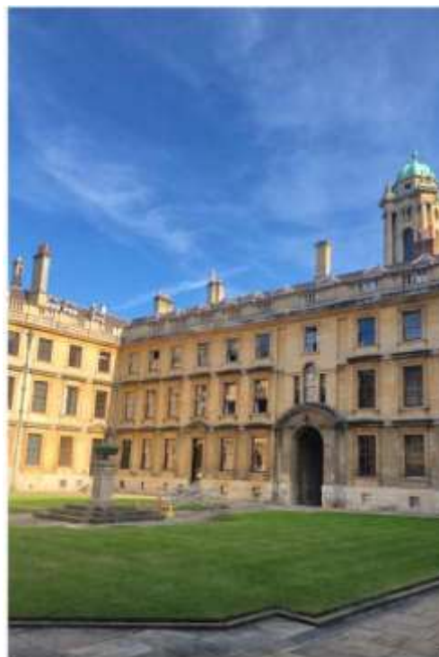
Back Quad, where the JCR is located

Finally, connected to the other end of the JCR Kitchen is the Old Taberdar's Room (OTR), a quaint wood-panelled room complete with fireplace and sofas; it is commonly used for formal pre-drinks, reading, or napping (if discouraged by college).