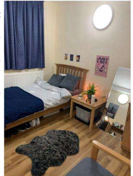
A room in Carrodus Quad

Unlike the accommodation at a lot of universities (and even in some Oxford colleges), the rooms are not organised into 'flats' and do not have kitchens or communal spaces. However, Queen's has a big JCR common room for everyone to use with sofas and a TV (which is open 24/7), as well as a JCR kitchen.