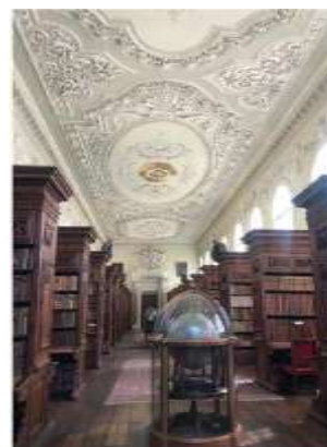
The beautiful Upper Library

Expect to have a subject specific library induction during Freshers' Week - the librarians will walk you through how to reserve books, how to return them and where your subject specific collection is.