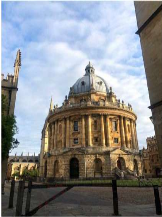
The Rad Cam

The Bodleian Libraries is the name for the University library as a whole and doesn't include college libraries. Confusingly, this isn't one single library but refers to the many subject libraries spread throughout Oxford, as well as the central lending Library, also known as the Bodleian, but often affectionately called just 'The Bod'. There's three separate reading rooms including Duke Humphrey's, which is the most picturesque of Oxford libraries, if terribly dim to work in - and yes, they did film Harry Potter here.